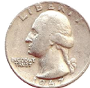
Standard (ST) = Quarter Size